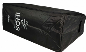
iCover Dilos Cover For Dilos.